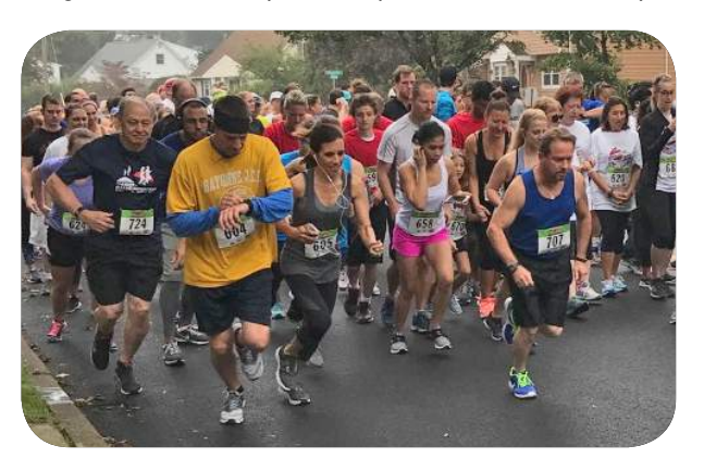
Runners begin the Apple Chase Spa 23 5K/12K on Sunday, October 15.