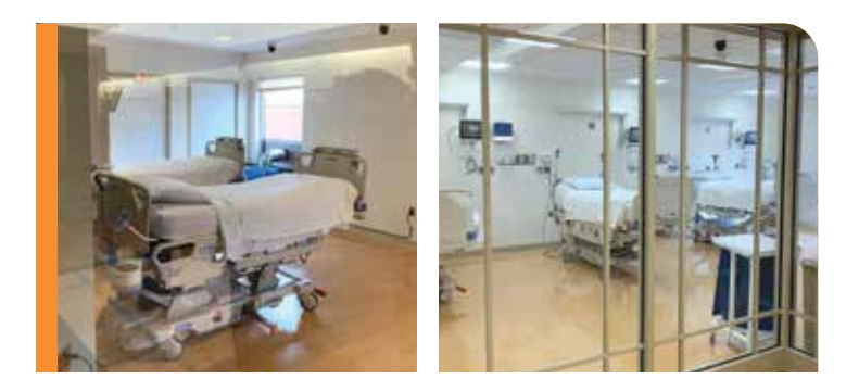
Unique, large windows and other technological advances allow health care providers on 7 East to more easily and safely monitor patients.

To facilitate better patient monitoring and reduce exposure for staff caring for COVID-positive patients,