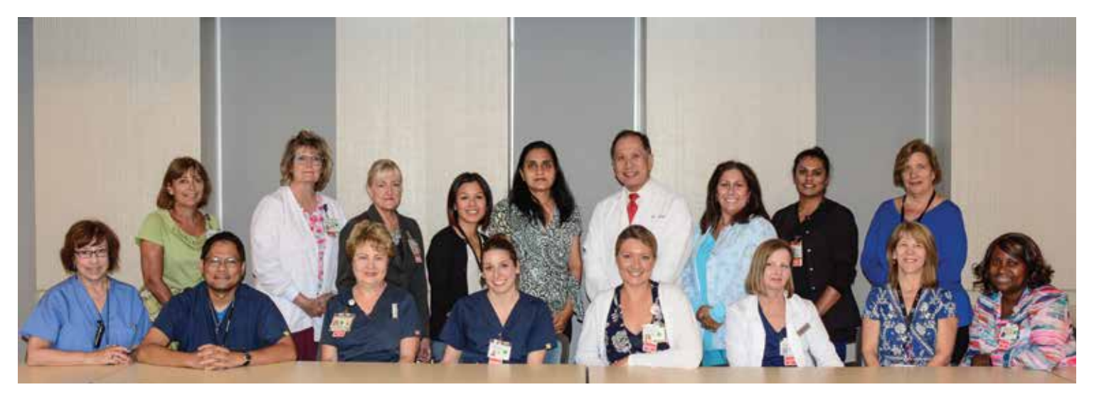
The ERAS multidisciplinary team includes physicians and surgeons; nurses with specialties in pre-admission testing, ostomy care, perioperative, operating room, recovery room, inpatient, data analysis and case management; anesthesia team; physical therapists; nutritionists; pharmacists; and the Overlook administration team.

ERAS. Not all places use ERAS; those that do, generally use only parts of it. We use it comprehensively. The commitment by our teams – from before admission to after discharge – truly enhances surgery and is second to none."