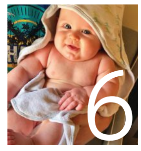
Moments That Matter: Parents' Intuition and Doctors' Expertise