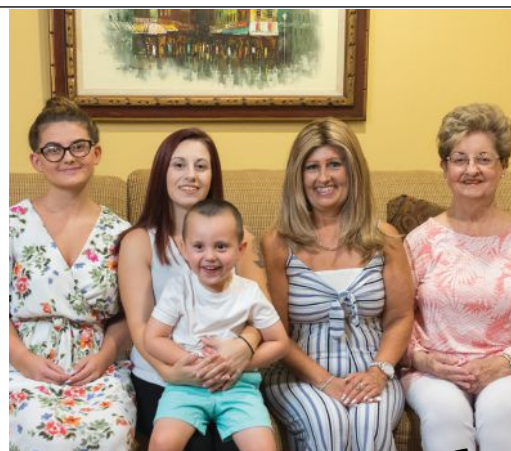
Moments That Matter: Overcoming Breast Cancer