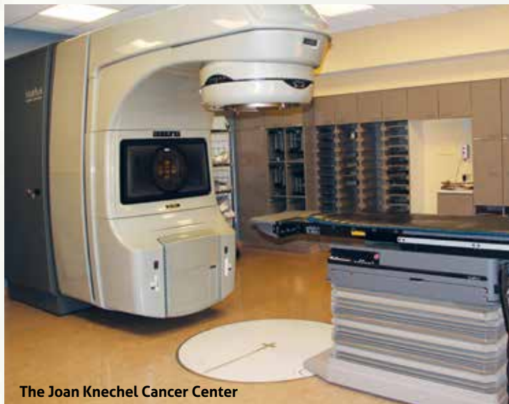
The Joan Knechel Cancer Center