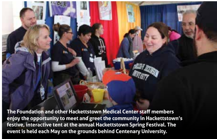
The Foundation and other Hackettstown Medical Center staff members enjoy the opportunity to meet and greet the community in Hackettstown's festive, interactive tent at the annual Hackettstown Spring Festival. The event is held each May on the grounds behind Centenary University.

32nd Annual Foundation for Hackettstown Medical Center Golf Classic – Monday, June 4 – Scenic Panther Valley Golf & Country Club is once again the site of this popular golf outing that is the foundation's second largest annual fundraiser.